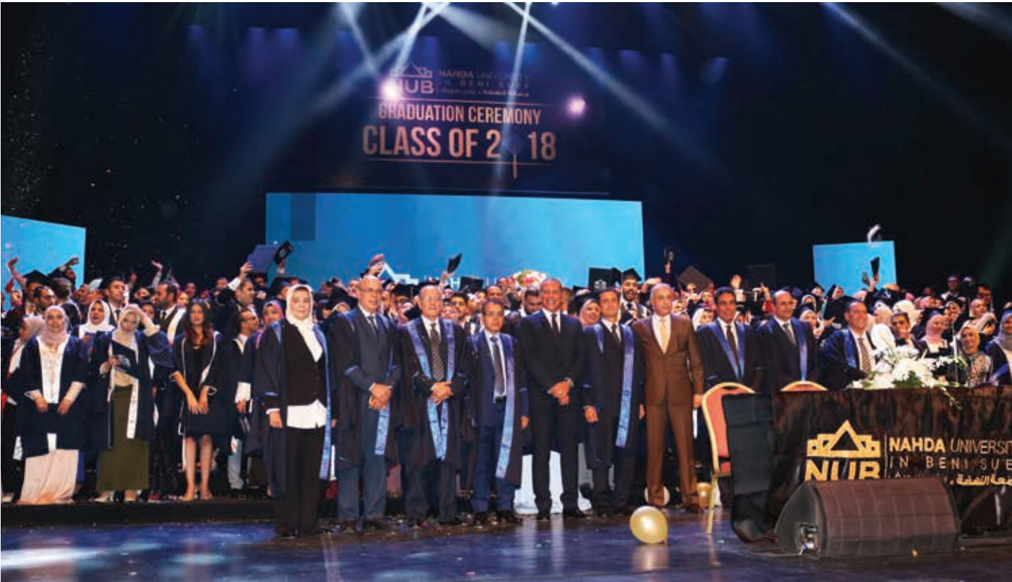
Students Graduation Ceremony Class of 2018