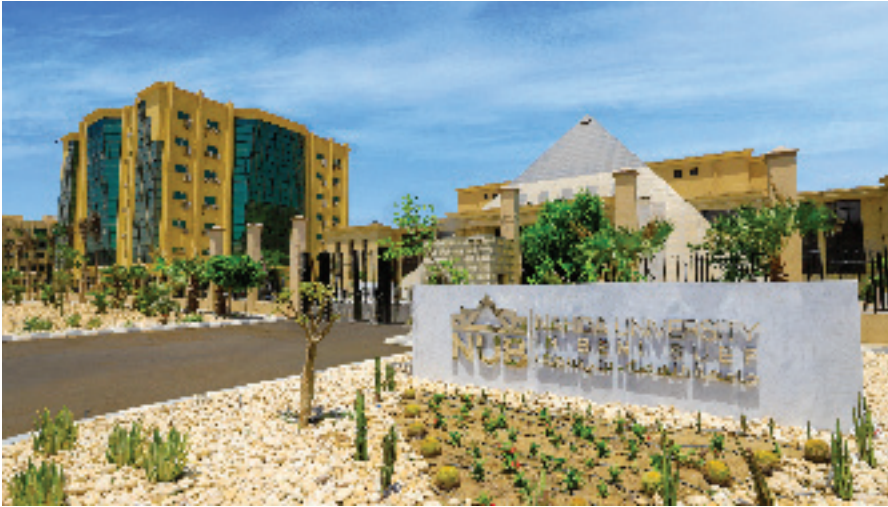
Building of faculty of medicine located next to the main administrative building of the university